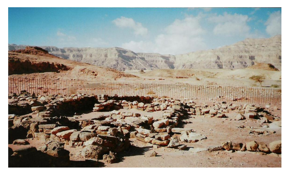
Fig. 3. Timna vallery: Smelting Site 2