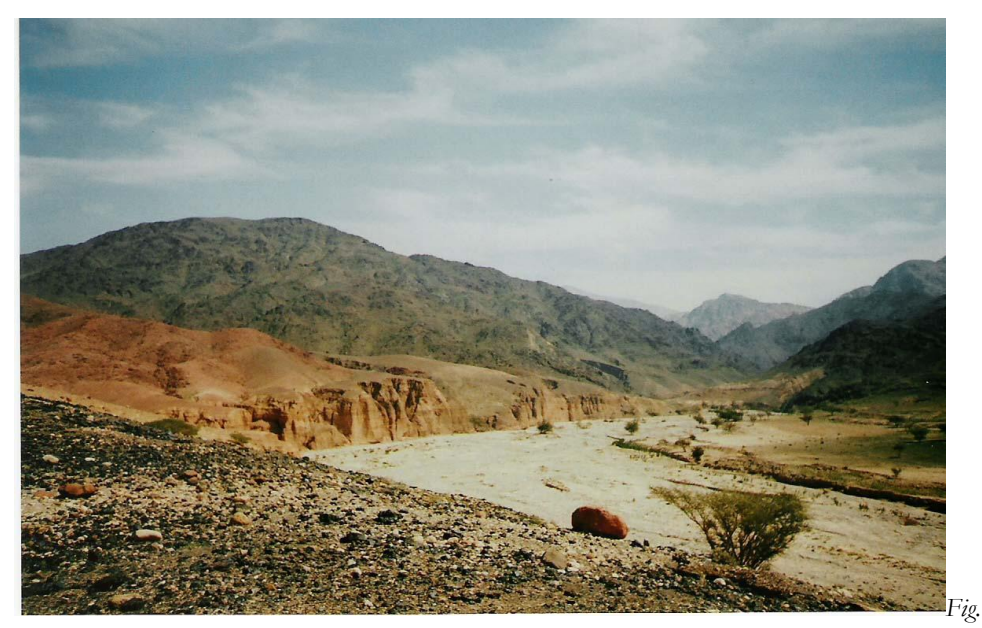
2. Wadi Faynan