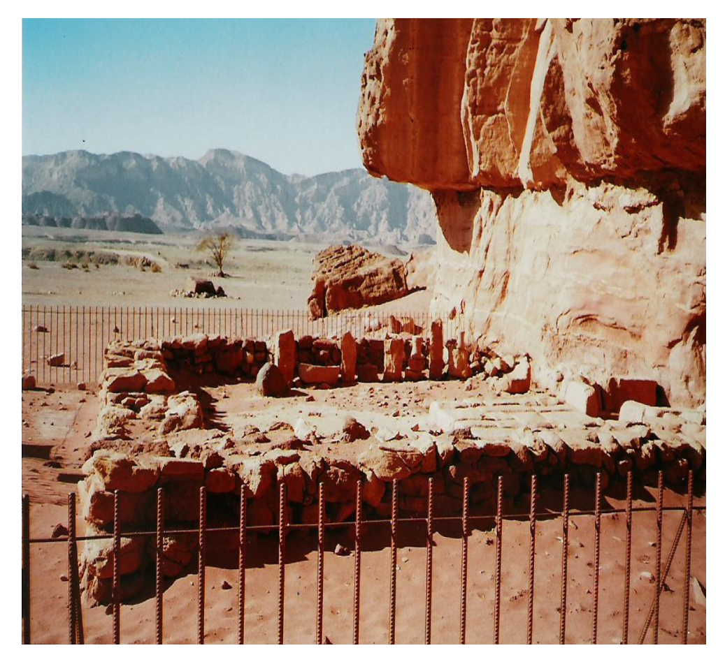
Tebes: "A land whose stones are iron, and out of whose hills you can dig copper" 91